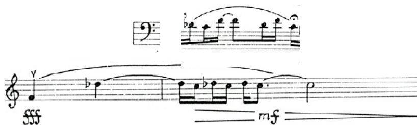
Figure 1: Two instances of the segmental pattern [[0,1,5]] in Keren . Top: segment 6; Bottom: segment 42. Score fragment reproduction from Keren , Editions Salabert, Paris, 1989.

This viewpoint shows interesting musical relations, where pitches in a segment are shared, but segments can differ in any other property: the order and the repetition of the pitches in the segment, the register, the length of the segment, rhythm, and so forth. All results obtained with this viewpoint were of length 1: no longer pattern appeared more than once in Keren .