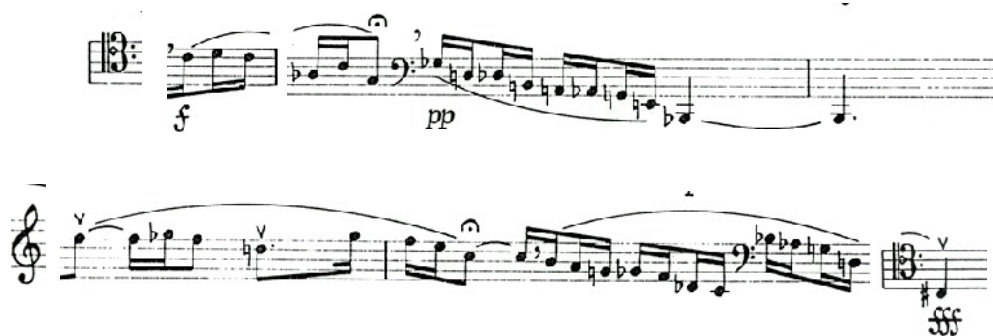
Figure 2: Two instances of the segmental pattern [[+,-,+,-],[-]] in Keren . Top: segments 3 and 4; Bottom: segments 17 and 18. Score fragment reproduction from Keren , Editions Salabert, Paris, 1989.

Figure 2 demonstrates this pattern and its instances. The two instances have an interesting similarity between them, the first pattern in each being the characteristic melodic pattern which makes use of the intervals \pm 1 , \pm 4 , \pm 5 , and the second being this downward characteristic movement, also seen in the melodic viewpoint results above.